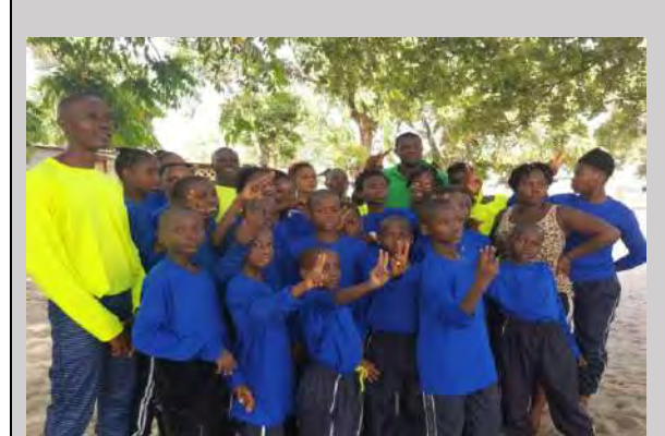
Some parents and local mentors with the kids.