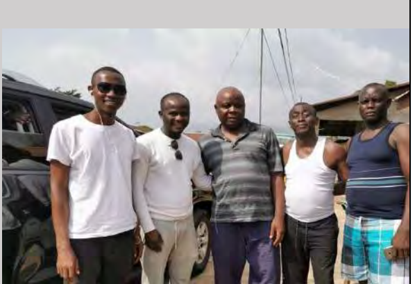
JOY Programme Coordinator, President of Messeh Leone Foundation Trust, and the village chief/community stakeholders.